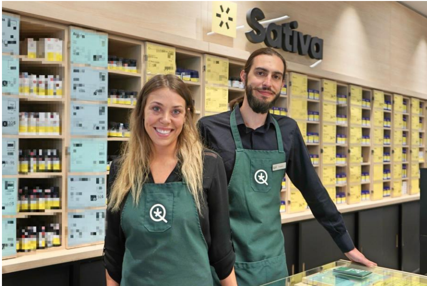
Public SQDC Store in Montreal